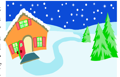
Matthew House Looks Back 2008

Many larger agencies have the advantage of expensive advertising and mailings. However, we do not and do the advertising ourselves and I like it that way. I personally get to sign every letter, praying over your donation and asking God to bless you in all you do. I recognize many of your names now as monthly faithful donors and others who open their hearts specifically during the Thanksgiving and Christmas season. Every gift